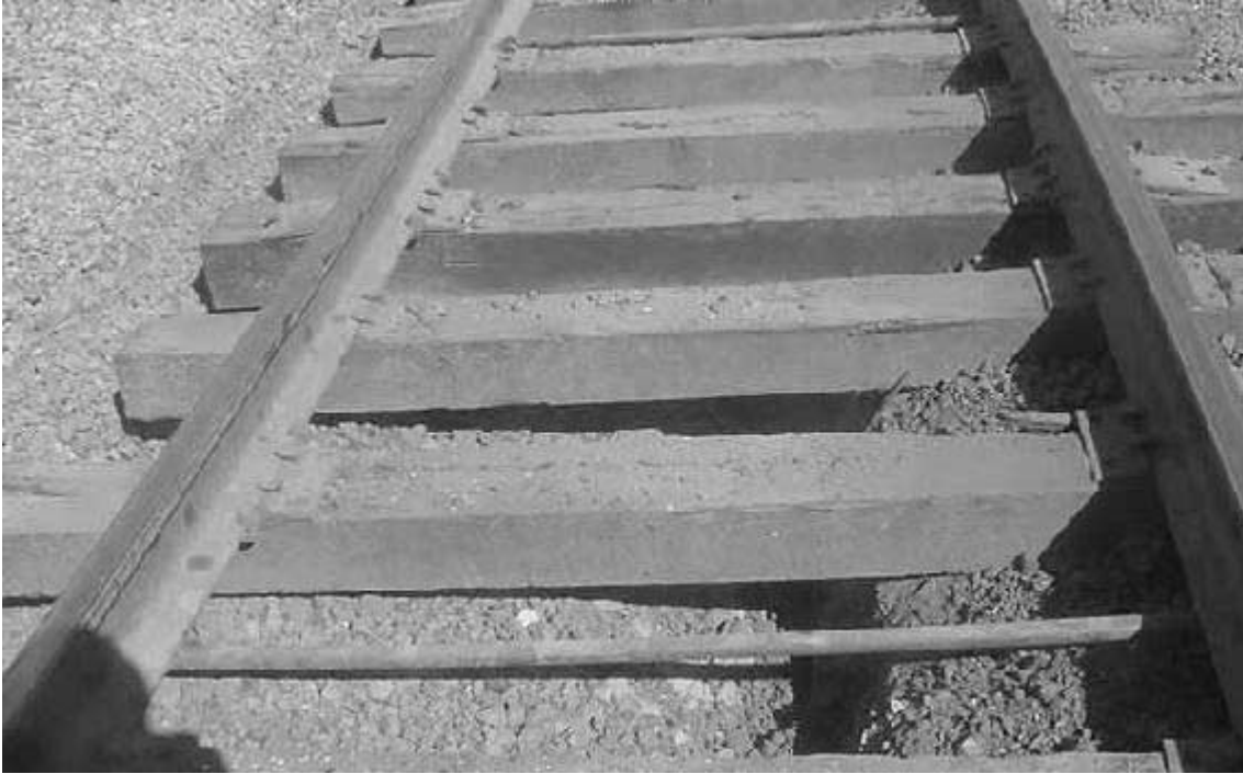
Figure 10. Slide at SPCC KM 87.6