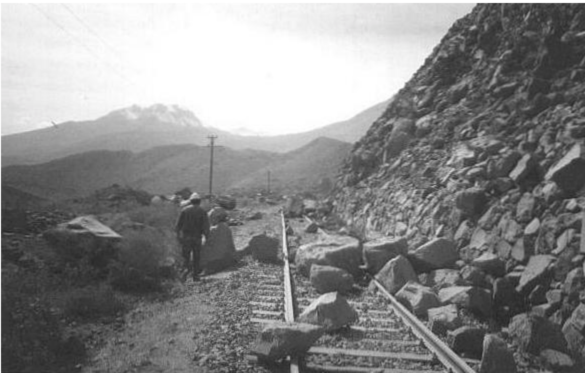
Figure 3. Rock-fall at Arequipa-Puno KM 35