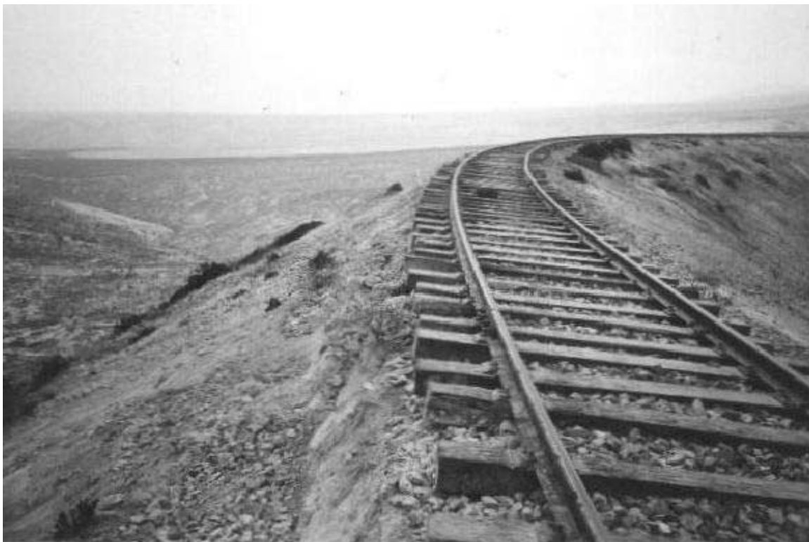
Figure 5. Slide at Matarani-Arequipa KM 14