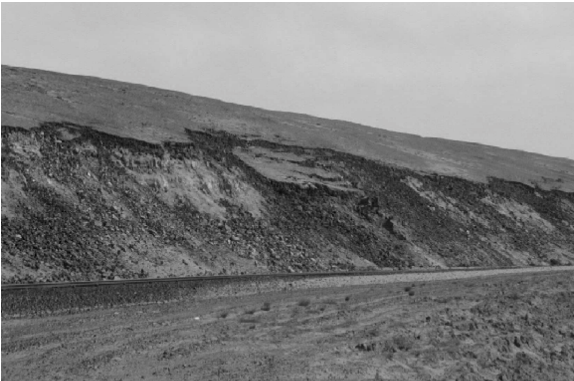
Figure 9. Slide above track near SPCC KM 40