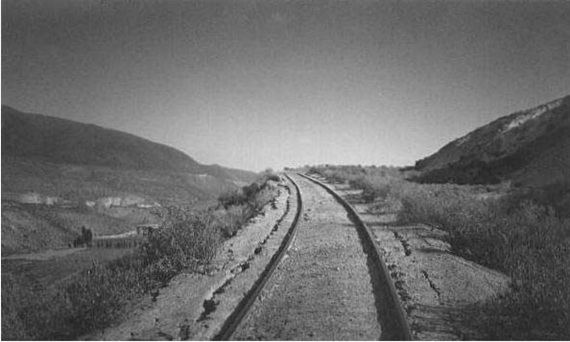
Figure 8. Embankment cracks at Arequipa-Puno KM 50