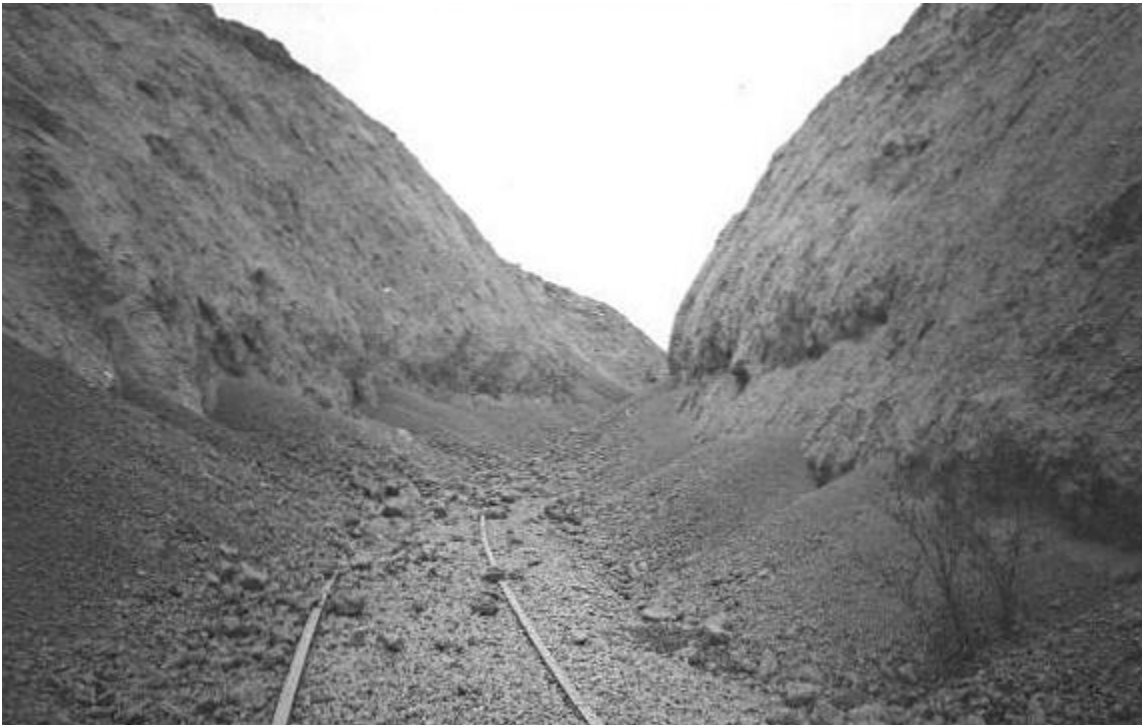
Figure 2. Cut at Matarani-Arequipa KM 17