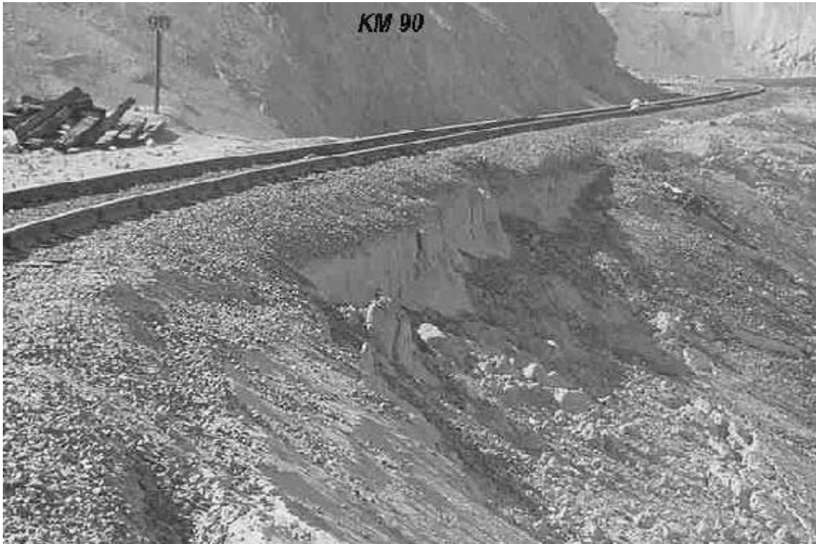
Figure 6. Slide at SPCC KM 90