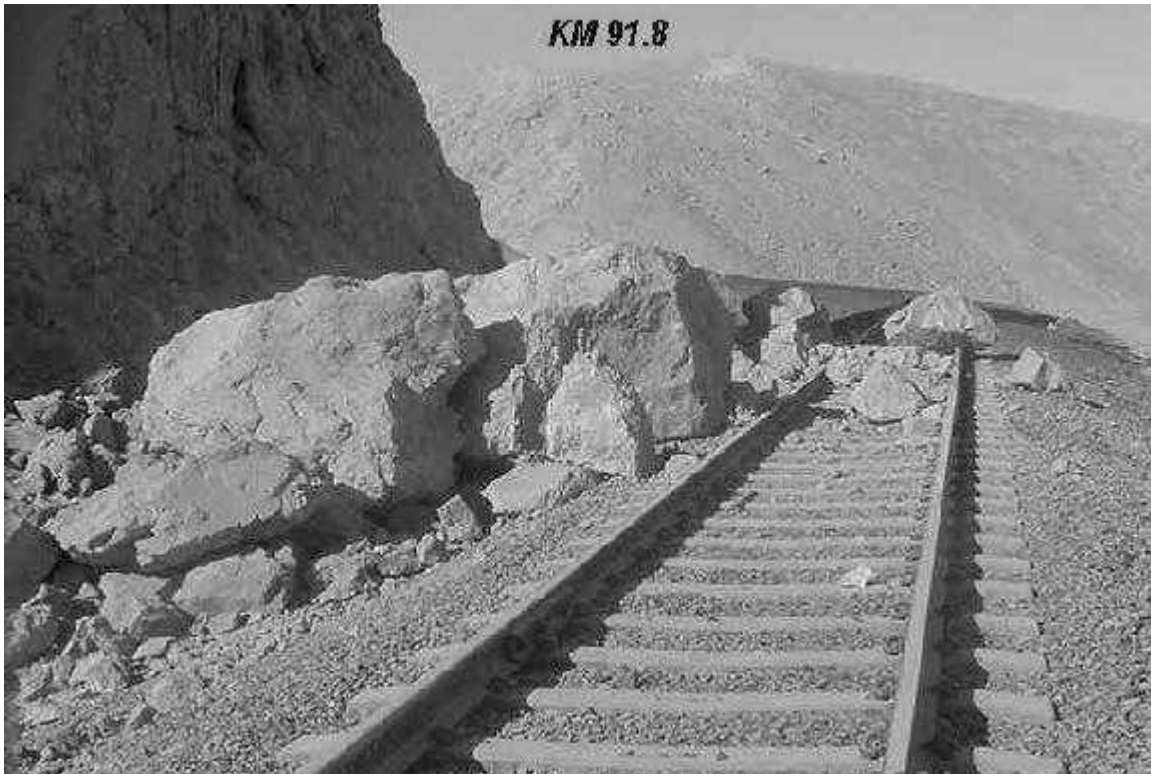
Figure 4. Rock-fall at SPCC KM 90