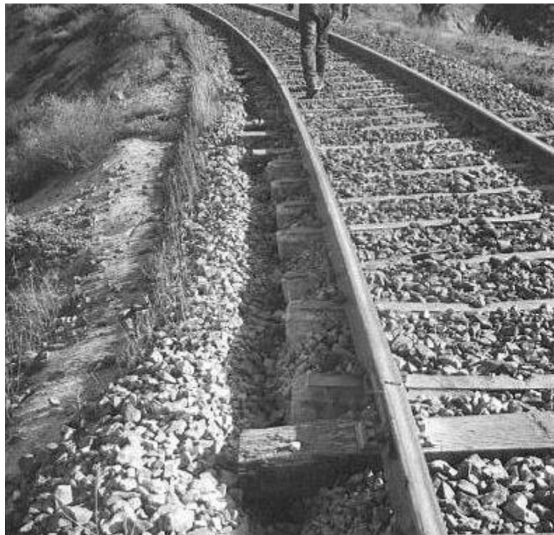
Figure 7. Displaced ballast at Arequipa-Puno KM 49